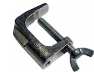
Clamp terminal with banana plug termination