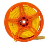
Earthing measurement test lead with banana plugs on reel; 50 m; yellow