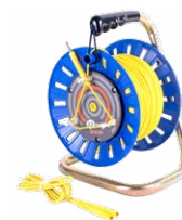
Test lead 75 / 100 / 200 m yellow, for MRU (banana plugs, on a reel)

WAPRZ075BUBBSZ WAPRZ100BUBBSZ WAPRZ200BUBBSZ