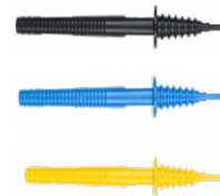
Pin probe CAT III/1000V CAT IV/600V black/blue/yellow