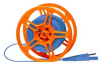
Test lead 15 / 25 m blue, for MRU (on a reel)