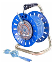
Test lead 75 / 100 / 200 m blue, for MRU (banana plugs, on a reel)

WAPRZ075REBBSZ WAPRZ100REBBSZ WAPRZ200REBBSZ