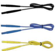
Test lead 1.2 m CAT III/1000V CAT IV/600V black/blue/yellow