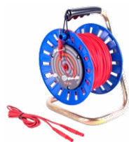
Test lead 75 / 100 / 200 m red, for MRU (banana plugs, on a reel)

WAPRZ075REBBSZ WAPRZ100REBBSZ WAPRZ200REBBSZ