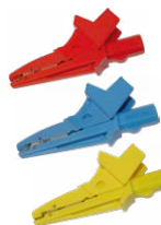
Crocodile clip, 1 kV 20 A red/blue/yellow