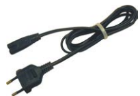
230 V power cord (IEC C7 plug)