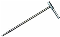
2x earth contact pin probe (30 cm)