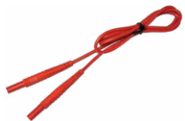
Test lead with banana plugs; 1 kV; 1.2 m; red