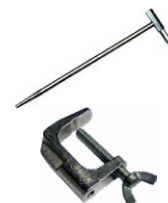
4x earth contact test probe (30 cm)