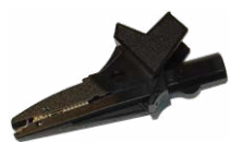
Crocodile clip 1 kV 20 A black